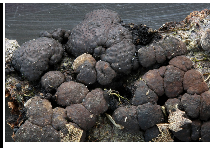
Left, the tiny orange discs of Calloria neglecta found on a nettle stem; above, Annulohypoxylon cohaerens (no common name but a species closely related to the much more common Hypoxylon fragiforme -Beech Woodwart) and identified by Claudi today. (cvs)