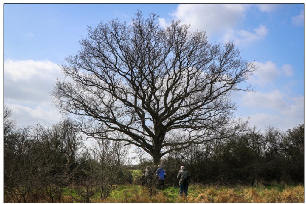
Members of the group about to negotiate a ditch at Bicester today (JL)