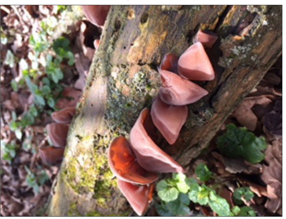
Auricularia auricula-judae fruiting on an unusually thick dead Elder trunk. (DS)

Elder and the only other trees nearby were Oak and Willow, both of which would have been somewhat unusual hosts for this species. A few minutes later we noticed another cluster on an equally thick trunk which still had bark in place though this was fissured as in Oak or Willow. However, there were typical Elder leaves just emerging from some of its thinner branches and Justin checked that when bruised they had the tell-tale smell of catpee. Problem solved!